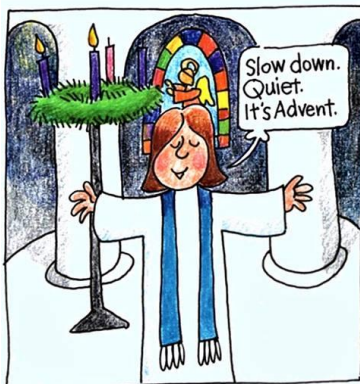
ONE SUNDAY IN ADVENT